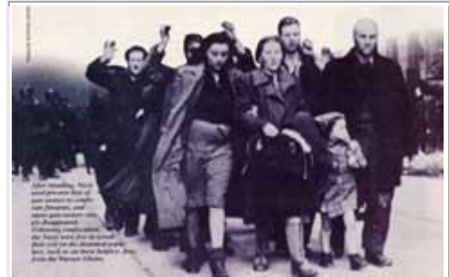
After invading, Nazis used pre-war lists of gun owners to confiscate firearms, and many gun owners simply disappeared. Following confiscation, the Nazis were free to wreak their evil on the disarmed populace, such as on these helpless Jews from the Warsaw Ghetto.

All hell broke loose on Nov. 10: "Nazis Smash, Loot and Burn Jewish Shops and Temples." "One of the first legal measures issued was an order by Heinrich Himmler, commander of all German police, forbidding Jews to possess any weapons whatever and imposing a penalty of twenty years confinement in a concentration camp upon every Jew found in possession of a weapon hereafter." 3 Thousands of Jews were taken away.