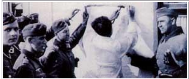
Invading Nazi troops in Holland in 1940 immediately nailed up posters announcing a ban on all firearms. From Die Deutsche Wochenschau , May 15, 1940.

Searches of Jewish homes were calculated to seize firearms and assets and to arrest adult males. The American Consulate in Stuttgart was flooded with Jews begging for visas: "Men in whose homes old, rusty revolvers had been found during the last few days cried aloud that they did not dare ever again return to their places of residence or business. In fact, it was a mass of seething, panic-stricken humanity." 4