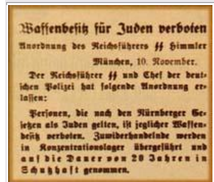
At the time of the Nazi attack on Jews known as Night of the Broken Glass, Heinrich Himmler, head of the Nazi SS and Police, ordered Jews disarmed ( click for closeup ). People's Observer ( Völkische Beobachter ), Nov. 10, 1938.