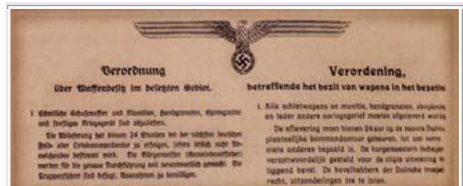
The Holland Poster banning guns ( click for closeup). Citizens had 24 hours to surrender all firearms to the Nazis or face the death penalty. Printed in German on the left and Flemish on the right. For translation, see below. From Die Deutsche Wochenschau , May 15, 1940.

The film shows artillery and infantry rolling through the streets as happy citizens wave. It