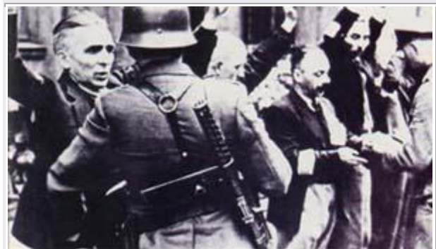
Resistance to Nazi oppression was hampered by the lack of civilian arms possession. One of the most notable exceptions was the Warsaw Ghetto Uprising in 1943, which began with a few incredibly brave Jews armed with handguns. They were able to temporarily stop deportations of Jews to Nazi extermination camps.

Out of all the acts of armed citizen resisters in the war, the Warsaw Ghetto Uprising of 1943 is difficult to surpass in its heroism. Beginning with just a few handguns, armed Jews put a temporary stop to the deportations to extermination camps, frightened the Nazis out of the ghetto, stood off assaults for days on end, and escaped to the forests to continue the struggle. What if there had been two, three, many Warsaw Ghetto Uprisings?